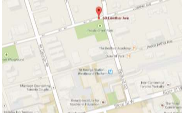
Map: 60 Lowther Ave, Friends House