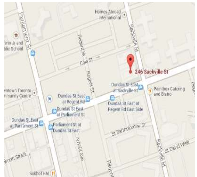
Map: 246 Sackville Street