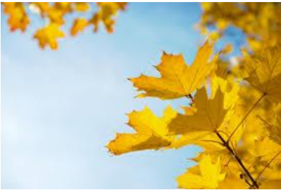
Autumn begins this month!