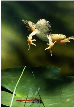
It's a Leap Year!

Consumer/Survivor Information Resource Centre of Toronto, 1001 Queen St. West, Toronto M6J 1H4 Phone Hours: M–F from 9–5 / Drop-in Hours: M–F from 9–4 Tel: 416-595-2882 csinfo@camh.ca http://www.csinfo.ca/