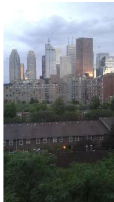
Photo Cred.: Leslie —to read Leslie's and others' favourite Toronto gems , see page 5.

“A box without hinges, key, or lid, yet golden treasure inside is hid.”